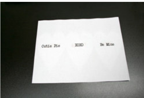
Step 1. Print out template sheet